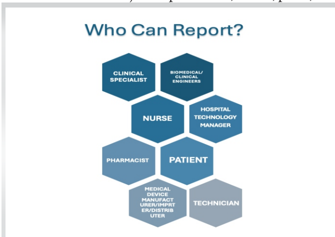
Figure 2: Who can report materiovigilance.

Orthopaedic surgery is unique in its reliance on medical devices that are often implanted within the human body for extended periods. Devices such as joint replacements, screws, plates, and