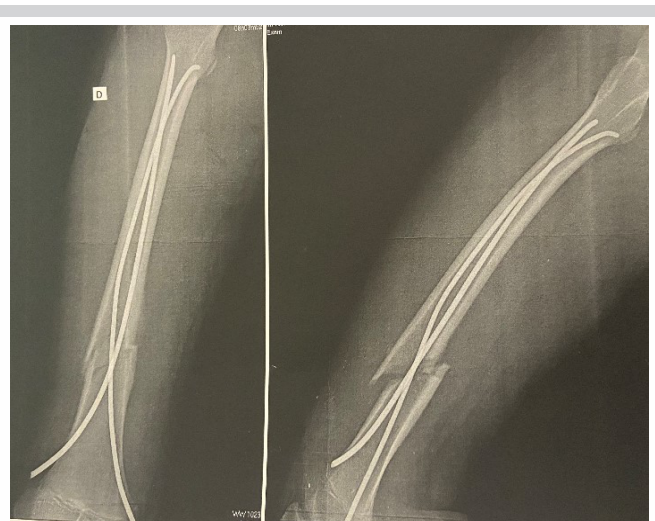
Figure 2: Follow-up X-ray after elastic stable intramedullary nailing.

Clinically, the patient was conscious, afebrile, and in a stable condition. The swelling was warm, painful, worsening at night without any signs of inflammation on the anterior compartment of the right thigh resulting in functional impairment of his right lower limb.