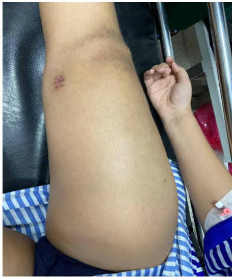
Figure 3: Giant swelling of the thigh.