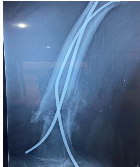
Figure 4: Anarctic bone callus with periosteal reaction.

suspicions of a bone tumor. The diagnosis of osteosarcoma was established by histologic confirmation [10].