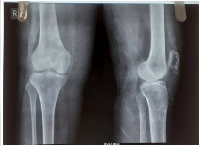
Figure 6: Post-operative X-ray.