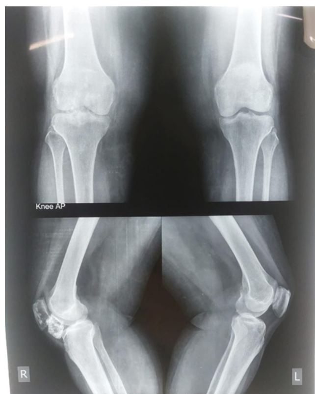
Figure 1: Pre-operative X-ray.

the usual age group and mimic other joint pathologies [5]. This case report aims to highlight the clinical features, diagnostic approach, and successful management of a rare presentation of