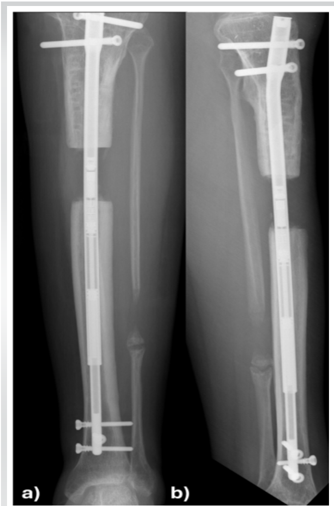
Figure 2: Anterior-posterior (a) and lateral (b) radiographs taken at 12th-week follow-up, showing insufficient callus formation.

magnetic intramedullary tibial lengthening nail was inserted and locked proximally and distally. Intraoperative fluoroscopy and post-operative radiographs confirmed satisfactory alignment and implant positioning (Fig. 1). A latency period of 7 days was followed by distraction at a rate of one mm every day, targeting a total lengthening of 40 mm.