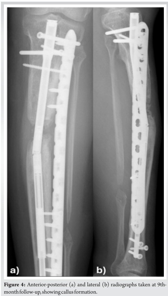
Figure 4: Anterior-posterior (a) and lateral (b) radiographs taken at 9th-month follow-up, showing callus formation.

construct with a lateral locking plate allowed us to neutralize torsional and bending forces at the fracture site. This approach aimed to minimize surgical trauma while restoring mechanical stability through plate fixation. In contrast to previously reported cases in which broken magnetic nails were removed before definitive stabilization, our patient achieved satisfactory clinical and functional outcomes despite retaining the fractured nail [10, 11]. At the 9-month follow-up, the LEFS score was 76/80 (95%), VAS scores were zero at rest and two during walking, and SF-12 PCS score was 52. These results are comparable to those reported in patients treated with intact PRECICE nails, suggesting that plate augmentation over a retained broken nail may be a viable salvage strategy in selected cases [12].