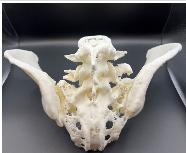
Figure 5: Post-operative lumbosacral spine.

accelerated lumbosacral degeneration and associated disk degeneration and discogenic pain and superior lumbar vertebral levels [14]. The underlying pathophysiology driving this process is unclear, but it often results in restricted range of motion and functional limitations. Surgical management consists of either lumbosacral fusion or resection of the hypertrophic TP, which can carry substantial complexity due to the associated aberrant congenital anatomy.