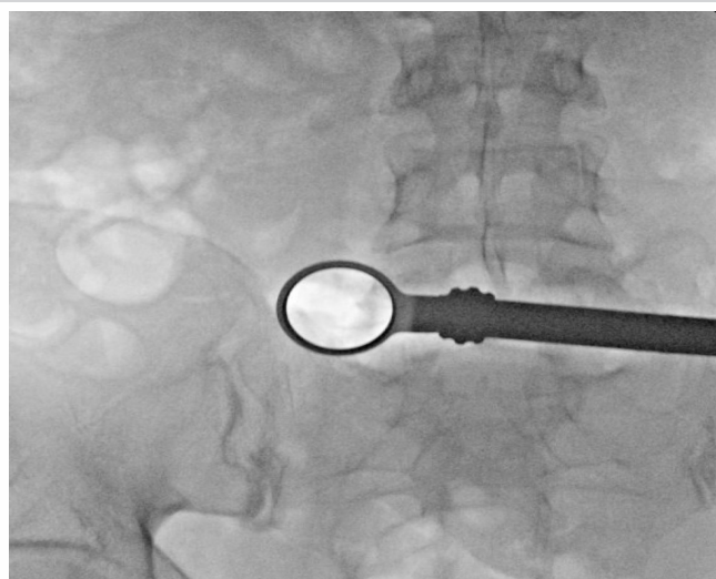
Figure 4: Intraoperative fluoroscopy. Intraoperative fluoroscopy demonstrating docking of tubular retractor.