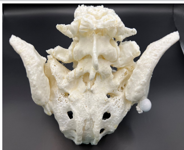
Figure 3: 3D-printed model posterior view. 3D-printed model of pre-operative lumbosacral spine – posterior view.