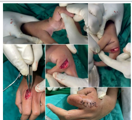
Figure 4: Intraoperative pictures showing clinical testing of MCP joint mobility and stability with closure in layers.

Patient was taken on the operating table under all aseptic precautions and under general anesthesia in supine position. Tourniquet applied. Scrubbing, painting, and draping done. Dorsal curved incision was taken over second MCP joint. Soft tissue dissected and extensor ligaments retracted. Longitudinal capsulotomy done to expose MCP joint. Intervening volar plate