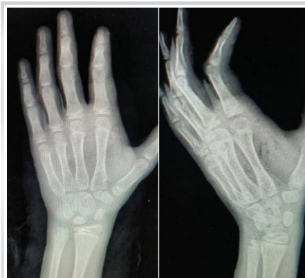
Figure 5: Immediate postoperative X rays showing reduced MCP joint of left index finger.