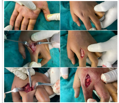
Figure 3: Intraoperative pictures showing puckering of skin due to metacarpal head entrapment, curved dorsal incision, buttonholing of metacarpal head and reduced MCP joint.

further injured due to traction of already buttonholed metacarpal head [4].