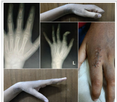
Figure 6: Follow-up at postoperative day 21 showing stable reduction and good functional outcome with healthy suture removal.