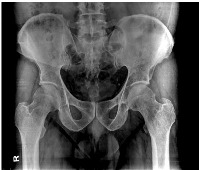
Figure 1: Radiographic examination of the pelvis with both hips image of a 44-year-old male at the time of presentation, with 4 weeks of left hip pain showing localized osteopenia in the left neck of the femur extending into the intertrochanteric region.

diagnosis (TTD). Despite the myriad strategies available to evaluate this hip disease, radiographs remain the common and first-line method of evaluation. Although TOH presents with radiological features such as subchondral cortical loss and osteopenia involving the femoral head and neck in radiographs, the features are not always present in all the patients of TOH who present early. However, magnetic resonance imaging (MRI) helps in the early identification of the disease with features such as bone marrow edema involving the femoral head and neck, even extending to the intertrochanteric region without findings of osteonecrosis. Other signs such as