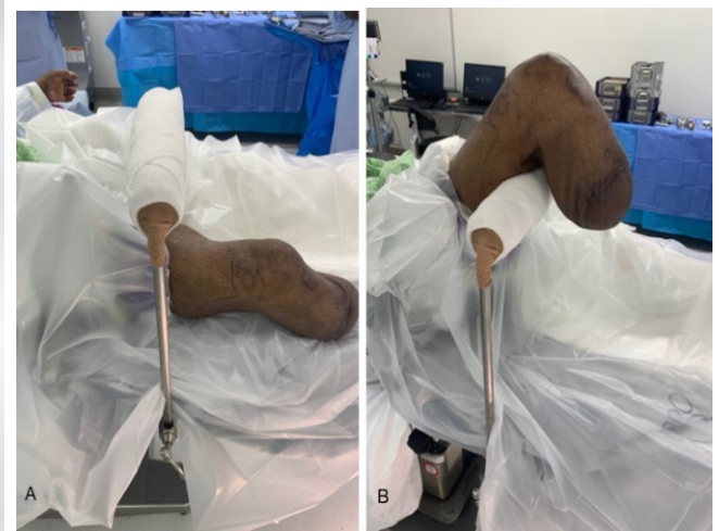
Figure 2: Pre-operative popliteal post positioning. (A) Extended, (B) Flexed.

to use case history, demographics, and photographs for publication of the case report. The patient is a 68-year-old male with a history of diabetic neuropathy and a BMI of 30.7 kg/m 2 who presented complaining of worsening right knee pain for several years. The right knee had a mild varus deformity, a range of motion of 0° to 120°, and no instability. X-rays revealed moderate tricompartmental degenerative changes. After failing all non-operative treatments, he was scheduled for the right TKA. While awaiting his surgery, he sustained second-degree burns to both feet from a hot shower. The patient initially presented to a hospital emergency department after noticing fluid draining from his lower extremities, and this injury resulted in a right BKA and left transmetatarsal amputation. After the patient's amputations, he regained his ability to ambulate using right below-knee prosthesis. The patient