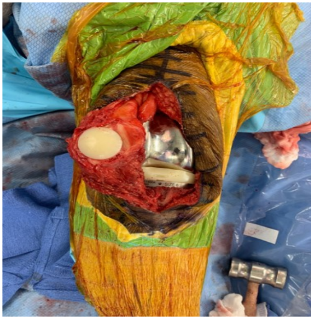
Figure 5: Femoral, Tibial, and patellar implants in place.

continued to suffer from right knee OA with pain, especially when weight-bearing. At 4 months post-operative, the patient's right BKA and left transmetatarsal stumps were well healed. The right knee range of motion was 0° to 110°. The patient was again offered surgery and elected to undergo a right TKA.