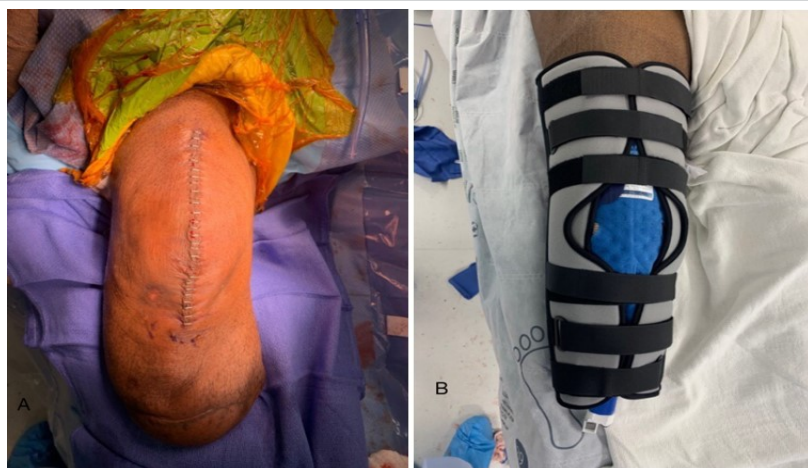
Figure 6: Post-operative images. (A) Incision closed via staples, (B) Knee immobilizer.

This patient's BKA was a result of thermal burns to the bilateral forefeet complicated by diabetic neuropathy. Due to his history of diabetes, this patient had an increased risk for a lower extremity amputation [8]. The patient elected to undergo TKA due to a history of OA and the failure of conservative treatment options. The patient ultimately wished to remain physically active and preserve his lower extremity function as much as possible. The patient's knee was preserved, making BKA the most appropriate definitive treatment in comparison to through-knee or above-knee amputation. Maximum functional recovery is achieved in BKA at higher rates than in through-