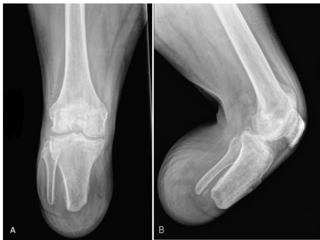
Figure 1: Pre-operative images. (A) Anterior-posterior view, (B) Lateral view.

and vascular injuries, while less acute indications include severe peripheral vascular disease, chronic non-healing ulcers, and persistent infections with a risk of sepsis [6].