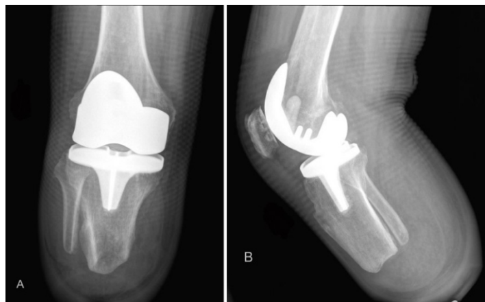
Figure 7: Final post-operative X-rays. (A) Anterior-posterior, (B) Lateral.

knee or above-knee amputations [9]. Knee arthrodesis is another alternative definitive treatment to be considered but has been shown to result in significant changes in normal gait kinematics with no increase in knee flexion [10].