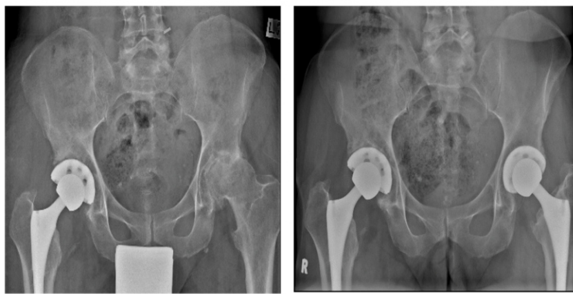
Figure 4: Radiographs after Stage 2 revision immediately (left) and 4-year post-operative (right).

agreed to a two-stage revision with a partial exchange, with retention of the well-fixed femoral stem.