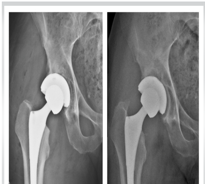
Figure 1: Immediate post-operative 2013 (left) and 3-year post-operative 2016 (right) show increased periacetabular radiolucencies and change in the position of the acetabular cup.

of the well-fixed femoral stem, who had excellent function and infection-free survival at 4 years of follow-up.