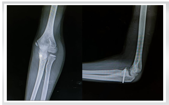
Figure 5: Post-operative anteroposterior and lateral radiographs.

with no step-off at the articular surface.