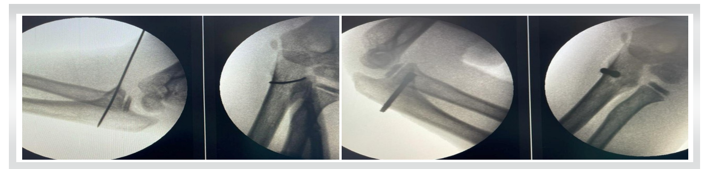
Figure 4: Reduction and fixation confirmed on fluoroscopy.

Isolated coronoid fractures are uncommon that too in the pediatric population, it is rare [4], making it rare to find references of these fractures treated surgically. It is pretty common to miss these fractures or misdiagnose in the pediatric population due to small fragments and the presence of cartilage. These injuries, especially Types II and III, if managed by closed reduction and casting or K-wiring, increase chances of non-union and recurrent dislocation due to unstable elbow. The elbow is prone to develop stiffness that too if intra-articular fractures are immobilized for a long period, certainly ends up in restricted elbow movements. Recommended idea to treat such fractures is by open reduction followed by rigid internal fixation