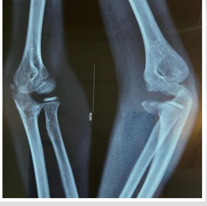
Figure 1: Regan and Morrey classification for<br/>coronoid fractures.Figure 2: Plain anteroposterior and lateral<br/>radiographs showing Type III coronoid fracture.