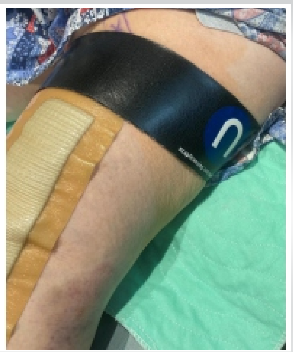
n c e suppo Figure 2: Placement of the NeuroCuple™ device above the rts the bandage following a total knee arthroplasty.

Although there is a consensus to reduce and sometime eliminate the use of opioids because of the ongoing opioid crisis and the documented associated risk of opioid use disorder in surgical patients, [4] most patients undergoing TKA are still prescribed a limited amount of opioids for breakthrough pain because evidence shows that the use of opioids facilitates immediate functional recovery following TKA [5].