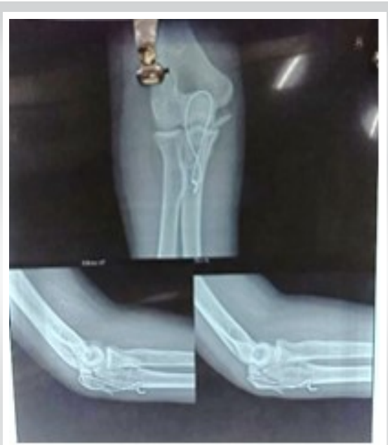
Figure 9: Immediate post-operative x-ray of right elbow showing tension band wiring done.

Percutaneous fixation maintains the integrity of soft-tissue biology by avoiding the dissection of soft tissues. This method results in minimal blood loss, reducing overall morbidity and rendering it suitable for patients, including patients with superficial and deep abrasions, namely Grade 2 and 3 (Oestern and Tscherne Classification) [6] and Grade 1 (Gustilo Anderson classification) [7] along with those at high risk for surgery. The risk of infection is also minimized since there is no traditional skin incision. In contrast, the open method, involving the dissection of soft