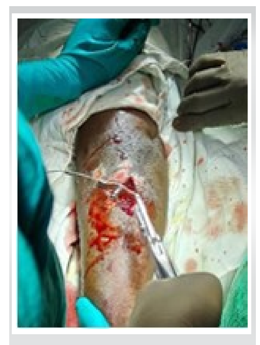
Figure 8: SS wire tightened and reduction achieved.

Olecranon fractures can be managed either conservatively or surgically with open reduction and internal fixation with tension band wiring and k wires or plating, as per Ronald, fixation with tension band wiring and plate was associated with various complications such as wound dehiscence, prominent hardware, loss of fixation, infection, and wound gaping [5].