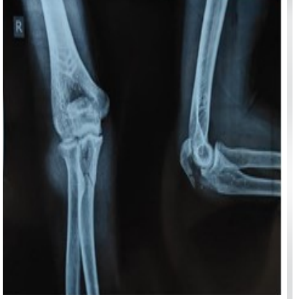
Figure 1: Right elbow showing multiple Figure 2: Right-sided olecranon fracture superficial graze abrasions.