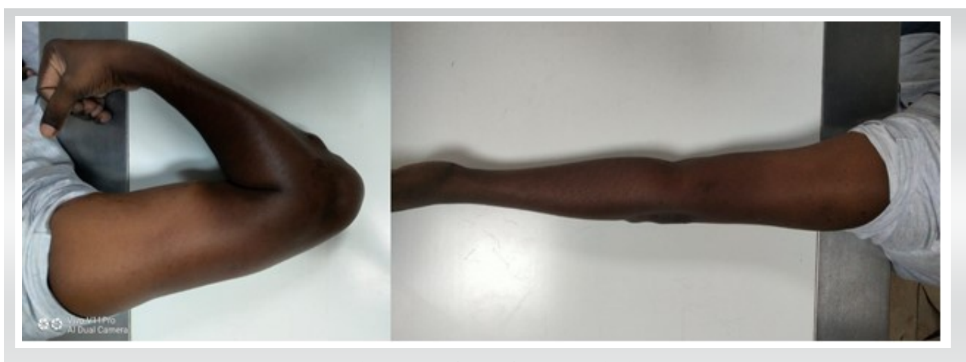
Figure 10: Four weeks post-operative recovery and restoration of range of motion at right elbow.

tissues, makes it challenging to align all fragments.