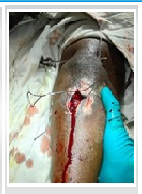
Figure 7: Wire loop passed to the incision site.

Figure 5: K-wire passed below the triceps tendon.