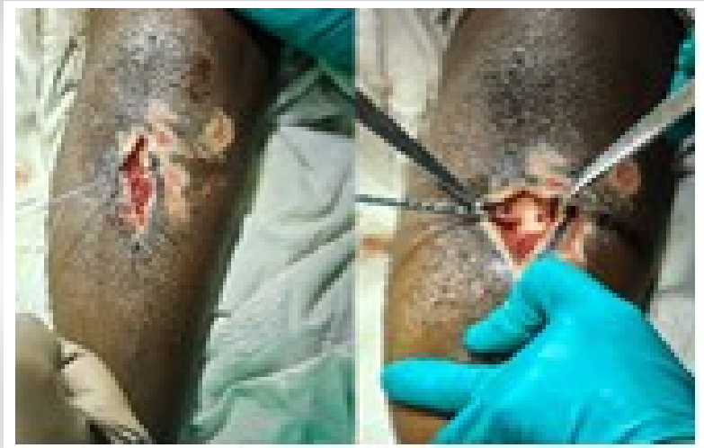
Figure 4: SS wire passed through tunnel.

On clinical examination, it was found that the patient had a superficial wound over the skin over the left olecranon and proximal ulna (Fig. 1) and radiographs confirmed a right comminuted displaced olecranon fracture (Fig. 2). Further, the wound was thoroughly washed, the limb was immobilized and the patient was started on broad-spectrum antibiotics. Due to the poor skin condition, a Plan for tension band wiring using a