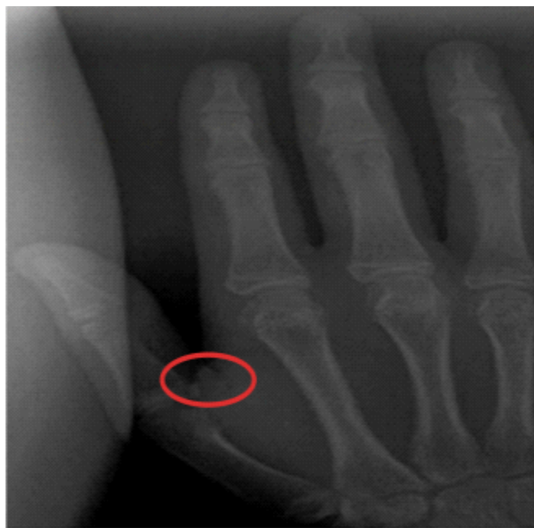
Figure 2: Anteroposterior radiograph demonstrating expected thumb adductor sesamoid ossification. Anteroposterior radiograph of the patient's right hand obtained at 15 years and 4 months of age on the same date as the left hand radiograph was taken. An ossific nucleus of the thumb adductor sesamoid is present at the first metacarpophalangeal joint (circled). The distal phalangeal physes are fused. This radiograph demonstrates the expected appearance of sesamoid ossification at this stage of skeletal maturation.

deviation from the expected, consistent maturation sequence outlined in the GPM (Fig. 1b). The patient was treated with a thoracolumbosacral orthosis nocturnal back brace, and had correction of her scoliosis over the course of 2 years.