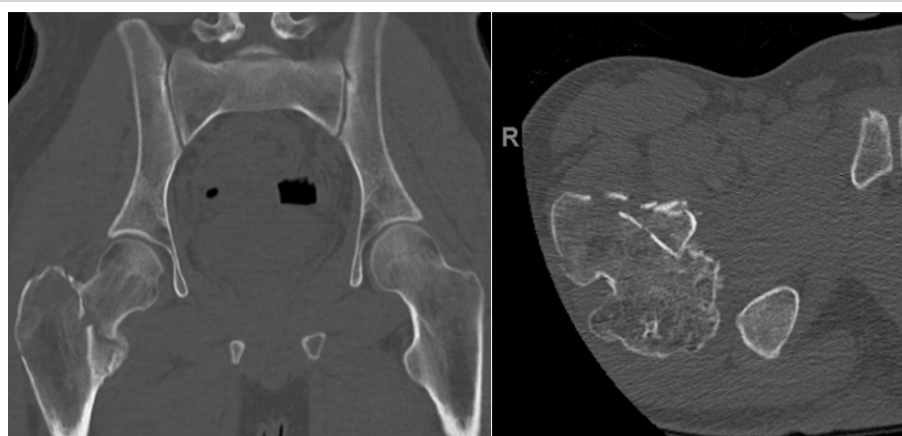
Figure 3: Coronal (left image) and axial (right image) computed tomography views outlining the fracture.

We believe that the priority in this case was to address the fracture and resect as much of the asymptomatic lesion as possible, mainly for histologic diagnosis and better healing. This was achieved in the operating room under general anesthesia after admission and preparation. To maintain simplicity and ease, we chose the lateral approach in the supine position. The reduction and fixation were aided by a fracture table and a short dual-screw cephalomedullary nail. The tumor was removed in a piecemeal fashion under fluoroscopy. Adequacy of resection was based on clinical and radiographic assessment of the ischiofemoral space. Histopathologic examination confirmed the diagnosis of osteochondroma. The patient was discharged on post-operative day 2 in good condition. He was allowed partial weight bearing for 6 weeks,