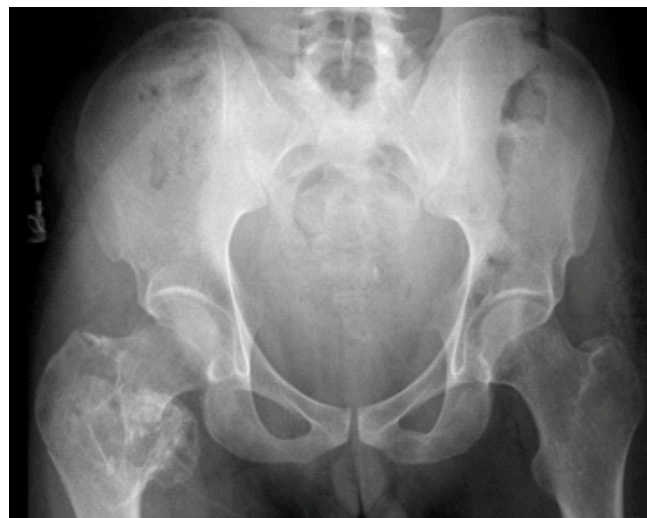
Figure 2: Pelvic radiograph obtained in the emergency department revealing right hip intertrochanteric fracture and osteochondroma.

An anteroposterior pelvic radiograph at that time was performed as a part of the Advanced Trauma Life Support guidelines, and an asymptomatic right proximal femur lesion, which the patient was not aware of, was noted (Fig. 1). On examination, right hip tenderness was detected, and minimal hip range of motion was painful. The motor, sensory, and vascular exams were normal. New radiographs revealed a right hip intertrochanteric fracture, in addition to the preexisting mass (Fig. 2). A computed tomography (CT) scan established the diagnosis of SFNO, which was continuous