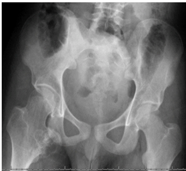
Figure 1: Pelvic radiograph showing right proximal femur lesion 6 years prior to the current presentation.

literature for appropriate treatment methods that may improve decision-making.