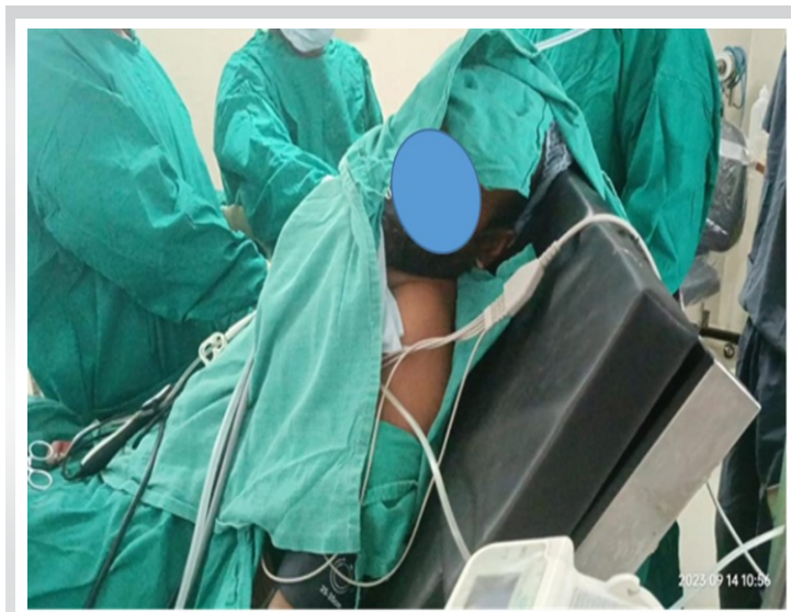
Figure 1: The patient undergoing arthroscopic rotator cuff repair under interscalene and suprascapular nerve block in a complete conscious state