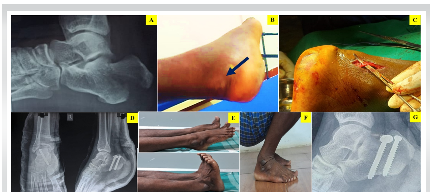
Figure 2: (A) pre-operative X-ray, (B) pre-operative clinical picture showing the skin impalement (black arrow), (C) intraoperative picture showing sural nerve identification and preservation, (D) post-operative X-ray showing cannulated cancellous screw fixation, (E-G) range of movements and X-ray after union at final follow-up.

Several classification systems have been proposed for calcaneal tuberosity avulsion fractures. The Lee classification [18], which is widely used, describes four types of fractures: Type I: Simple extra-articular avulsion fracture (sleeve fracture) Type II: Beak fracture with a large fragment Type III: Infratarsal avulsion fracture from the middle third of the posterior tuberosity Type IV: Beak fracture with a small triangular fragment (Fig. 1).