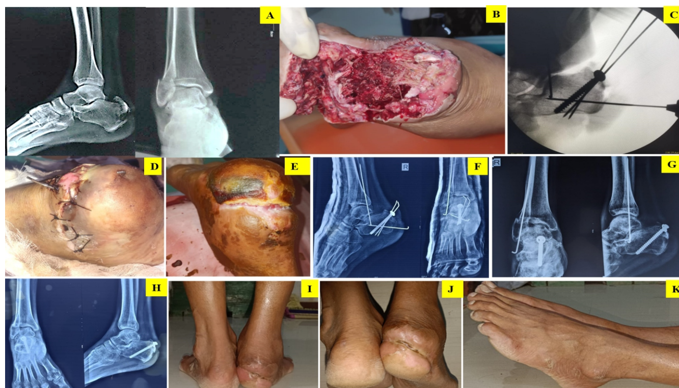
Figure 3: (a) pre-operative X-ray showing calcaneal beak fracture and lateral malleolus fracture, (b) pre-operative clinical image of the open fracture, (c) intraoperative C-arm image, (d) immediate post-operative clinical image, (e) clinical image after wound healing. (f) immediate post-operative X-ray with cannulated cancellous screws and k-wires for added fixation, (g) post-operative X-ray at 6 weeks, (h) post-operative X-ray showing fracture union at final follow-up, (i,j,k) post-operative range of movements after union at final follow-up.

More recently, the Carnero Martín de Soto classification has been introduced, which focuses on fracture displacement as a predictor of complications. This system classifies fractures as Type 1 (displacement <2 cm) or Type 2 (displacement \geq 2 cm), with Type 2 fractures associated with a higher risk of soft-tissue complications.