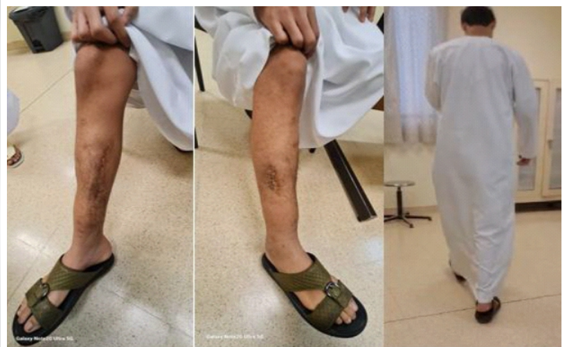
Figure 7: Clinical photograph of the patient after complete wound healing and resumption of normal activities.

This case demonstrates that the Masquelet-induced membrane technique, when combined with a non-vascularized mid-shaft fibular strut graft, is a viable and effective strategy for reconstructing large segmental tibial bone defects in skeletally immature patients. The approach provides structural support for earlier weight-bearing, reduces cancellous bone graft requirements, does not require microsurgical expertise, and