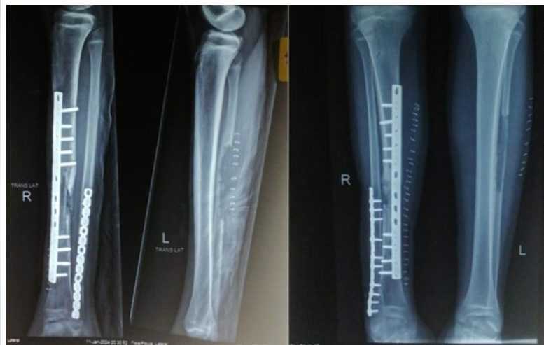
Figure 5: Post-operative anteroposterior radiographs of both legs following bone grafting.

regeneration. The fibular strut graft was placed intramedullarily within the induced membrane cavity to provide structural support (Fig. 4).