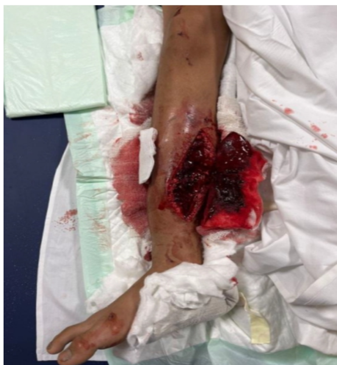
Figure 1: Clinical photograph of the open fracture (Gustilo-Anderson Type IIIB) of the right leg at presentation in the emergency department, demonstrating the extent of soft-tissue injury.

potential and minimizing donor site morbidity are paramount considerations.