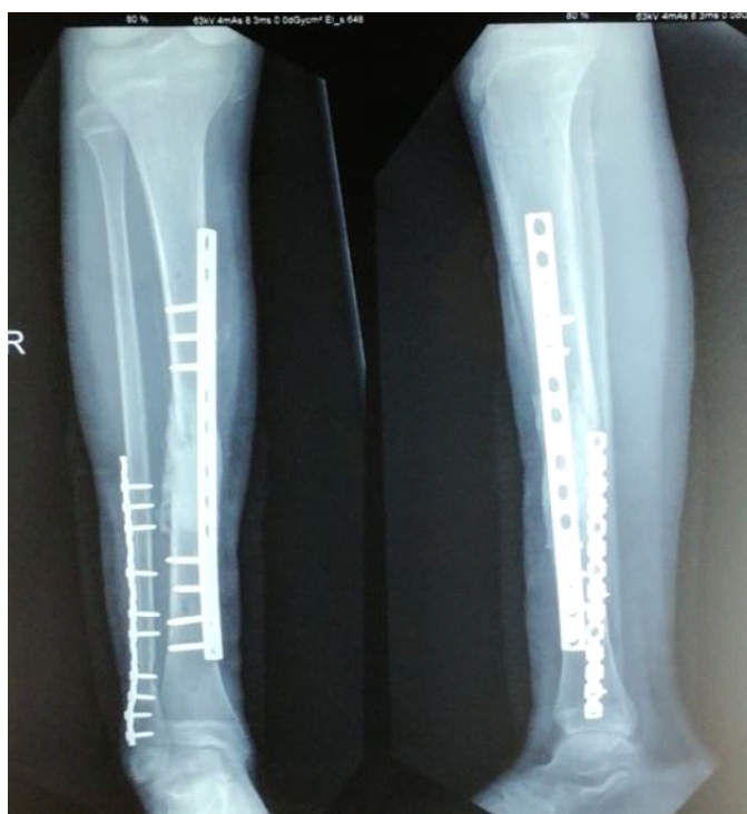
Figure 3: Post-operative anteroposterior and lateral radiographs showing internal fixation with the cement spacer in situ.

gland hematoma (40 × 22 mm), which was managed conservatively following general surgical clearance.