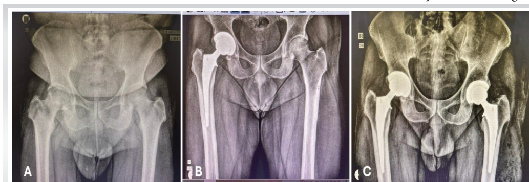
Figure 1: Serial anteroposterior radiographs of the pelvis demonstrating staged bilateral total hip arthroplasty. (A) Preoperative radiograph showing bilateral advanced hip disease (AVN). (B) Immediate postoperative radiograph following right total hip arthroplasty using collared stem. (C) Final follow-up radiograph after completion of bilateral total hip arthroplasty demonstrating well-fixed implants with satisfactory component position and restoration of limb lengths.

All primary THA during the study period were performed via DAA procedure, as it represents