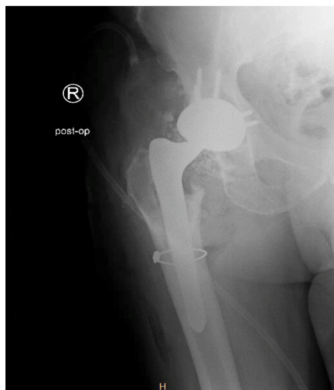
Figure 4: Post-operative radiograph after second-stage definitive THA. Post-operative AP radiograph demonstrating definitive implant including revision multi-hole acetabular component, cerclage cable, and a monoblock diaphyseal engaging stem.

After completion of 6 weeks of IV antibiotics, labs demonstrated a downtrending erythrocyte sedimentation rate and C-reactive protein within normal limits. The patient underwent re-aspiration, which was negative for infection. A total of 4 months after the revision spacer procedure, the patient underwent the second-stage procedure with definitive THA. After removal of the spacer components, a revision multi-hole acetabular component was implanted with multiple screws. A cerclage cable was placed to prevent fracture, then a monoblock diaphyseal engaging stem was placed, followed by antibiotic-