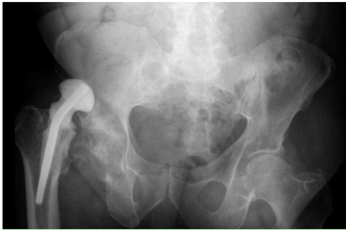
Figure 1: Dislocated antibiotic spacer. AP radiograph of the pelvis demonstrating posterior dislocation of the spacer relative to the acetabulum with no associated fracture evident.

patient-specific factors, including insufficient fixation of the spacer, typically due to undersizing, reduced femoral offset, acetabular bone loss, and patient noncompliance with post-operative instructions [9,10]. Spacer design may play a role, with some evidence for higher rates of mechanical complications, including instability in molded spacers compared to preformed spacers [5]. Interestingly, Bori et al. found no modifiable risk factors for spacer dislocation despite worse clinical outcomes in those patients [11]. Closed reduction may be attempted but with varying success rates; Faschingbauer et al. found that only four of 12 observed spacer dislocations could undergo closed reduction and stable retention [12]. Many cases have therefore traditionally been managed with Girdlestone resection arthroplasty, which sacrifices joint function and soft-tissue tension in order to prevent further mechanical complications or provide further infection control. However, recent evidence suggests that spacer revision can be an effective option with infection eradication and acceptable complication rates while preserving joint function [13].