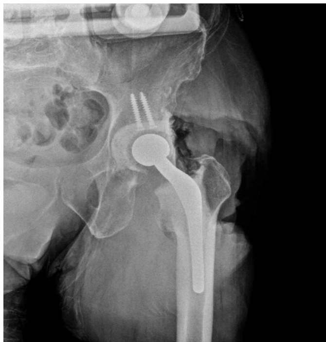
Figure 3: Intraoperative imaging of final spacer construct. Intraoperative AP radiograph of final spacer construct demonstrating stable alignment without fracture.

numerous flaws in the original procedure's surgical technique, including varus malpositioning, inadequate version, and leg length discrepancy. Intraoperatively, the femoral stem was well-fixed, and no purulence was noted, but there was significant superolateral acetabular bone loss with formation of a pseudoacetabulum.