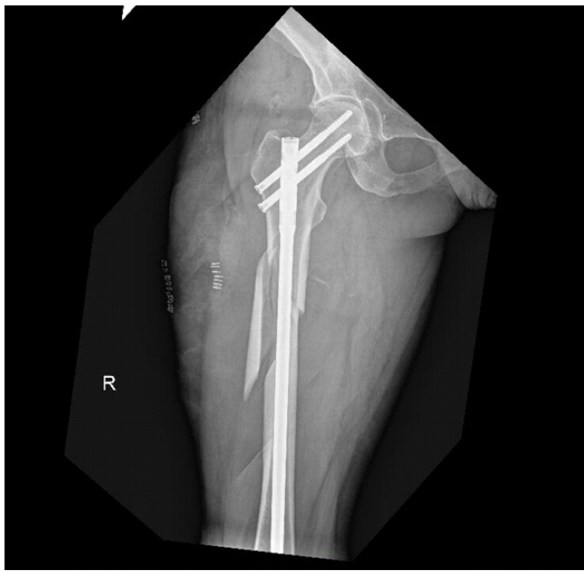
Figure 2: Initial intramedullary nail fixation. Immediate post-operative anteroposterior radiograph following intramedullary nail fixation of the subtrochanteric fracture, demonstrating initial acceptable alignment and implant positioning.

surrounding soft tissues using saline, dilute betadine, hydrogen peroxide, and Dakin's solution. After the aforementioned