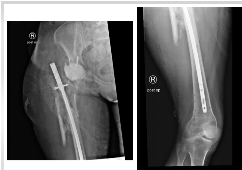
Figure 7: (a and b) Post-operative imaging after first-stage explantation and antibiotic spacer placement. Anteroposterior (a) and lateral (b) radiographs after first-stage surgery showing removal of failed hardware, placement of a static acetabular cement spacer, and insertion of an antibiotic-coated intramedullary nail spanning the proximal femoral defect.

ultimately leading to progressive catastrophic destruction of the proximal femur.