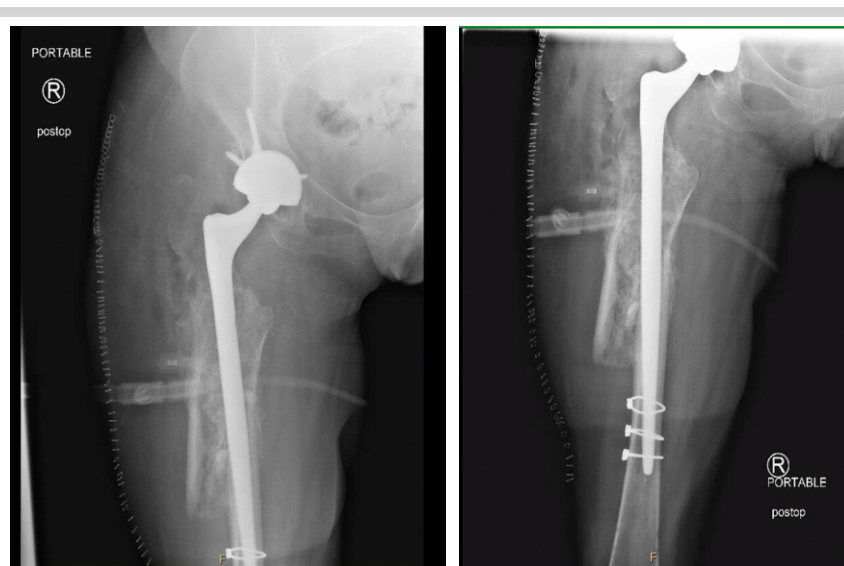
Figure 8: (a and b) Post-operative imaging after Stage 2 revision total hip arthroplasty. Proximal (a) and distal (b) Anteroposterior radiographs after revision total hip arthroplasty demonstrating a 54-mm acetabular shell with dual-mobility liner and a 17 × 300 mm tapered fluted revision femoral stem with cerclage fixation for diaphyseal support.

When failure of fixation occurs with peri-implant infection after treating subtrochanteric femur fractures, early recognition and transition to a staged reconstruction approach are critical. High-dose antibiotic spacers and diaphyseal-engaging revision stems allow for successful salvage, even in the setting of severe proximal femoral bone loss.