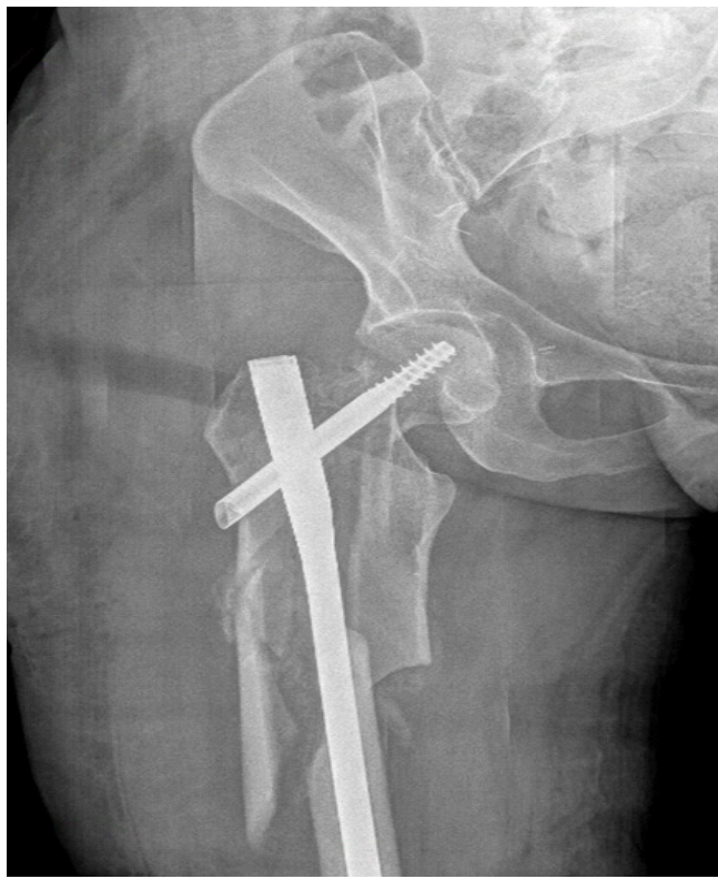
Figure 4: Revision intramedullary (IM) nailing with femoral neck fixation. Post-operative anteroposterior radiograph after hardware removal and revision IM nailing with femoral neck fixation using a cephalomedullary screw as a locked, cannulated lag screw.

surrounding soft tissues using saline, dilute betadine, hydrogen peroxide, and Dakin's solution. After the aforementioned