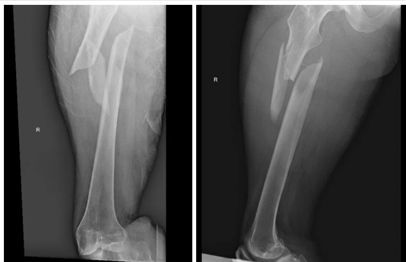
Figure 1: (a and b) Initial subtrochanteric femur fracture. Anteroposterior (a) and lateral (b) radiographs demonstrating a right subtrochanteric femur fracture with characteristic proximal fragment flexion/abduction and comminution consistent with a high-energy injury.

Aggressive irrigation and debridement were performed of the acetabulum, femoral canal, and