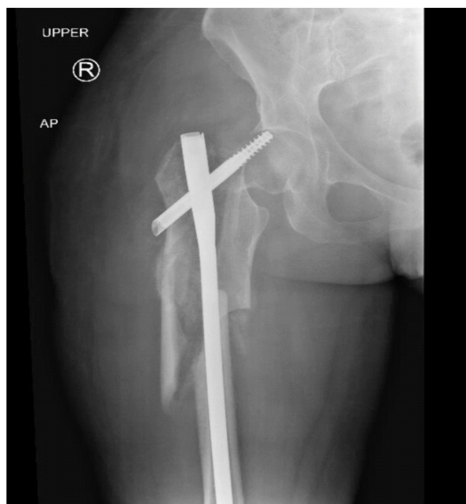
Figure 5: Second failure with a new femoral neck fracture. Anteroposterior radiograph following revision intramedullary nail and femoral neck fixation demonstrating subsequent failure with displacement of the femoral neck fracture and further compromise of proximal femoral structural integrity.

to 54 mm. A 54 mm modular revision acetabular component was implanted with excellent scratch-fit, secured with five acetabular screws, and a dual-mobility liner was inserted. Attention was turned to the femur, where significant malrotation and proximal deformity were noted. Prophylactic cerclage wiring (three cables) was placed distal to prior callus and fracture sites. After removing residual cement, the canal was sequentially reamed to a size 17 × 300 mm diaphyseal-engaging monoblock tapered fluted titanium stem. A -3 head was trialed and was stable with no signs of impingement or dislocation through a full arc of motion.