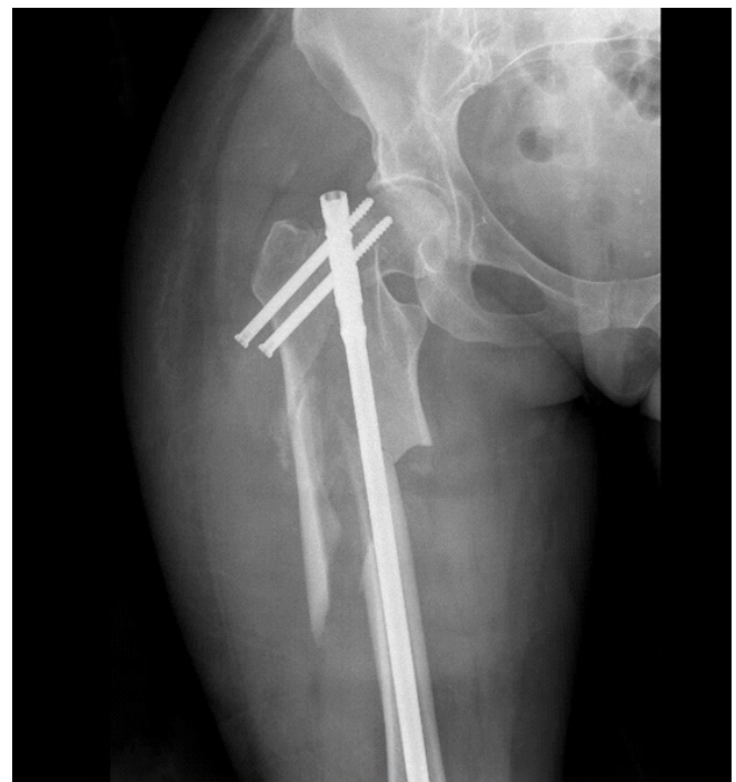
Figure 3: Failure of initial fixation. Anteroposterior radiograph showing interval loss of reduction with proximal screw cutout, flexion of the proximal fragment, and progressive proximal femoral erosion consistent with early fixation failure.

debridement, a spacer was constructed. Five bags of cement were prepared, each containing 2 g vancomycin and 1.2 g tobramycin. Two bags were used to fashion an acetabular cement ball, and three bags were used to coat an antibiotic IM nail. A 35 mm screw was inserted into the pelvis to anchor the acetabular spacer. The femoral canal was reamed to 14 mm, and the antibiotic nail was inserted. Postoperatively, the patient was started on intravenous (IV) vancomycin and transitioned to IV cefazolin and IV daptomycin.