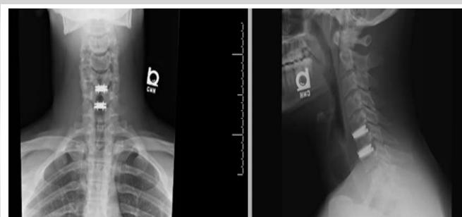
Figure 3: Cervical disk arthroplasty at C5–C6 and C6–C7.

ACDF is a procedure that is well-researched in high-level contact athletes, with mostly excellent results [1, 2, 11]. A few studies have assessed the efficacy of CDR with excellent results and no setbacks in returning to play [9, 11, 12]. This report