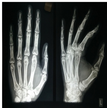
Figure 1: Pre-operative X-rays are showing well-defined homogenous foci of calcifications with lytic lesion in the left 2nd metacarpal

of temperature. There was complete range of motion of all joints of the index finger. Radiographs showed well-defined, homogenous focal lesions in the epi-metaphyseal regions of all bones of the hand and wrist (Fig. 1). The pelvis showed the well-defined homogenous lesions as well (Fig. 2). This was consistent with osteopoikilosis. The left second metacarpal had a characteristic expansile lytic lesion in the distal metaphyseal-diaphyseal region with no cortical breach. The zone of transition was well defined. This was considered to be an enchondroma. His laboratory and biochemical parameters inclusive of serum alkaline phosphatase, erythrocyte sedimentation rate, and complete blood count were within normal limits.