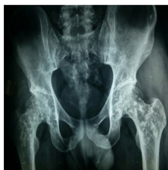
Figure 2: Homogenous lesions present in the pelvis as well.

osteopoikilosis that patient did not survive [4]. Pain is not a dominant feature of osteopoikilosis, but in 15%–20% of patients, slight joint pain, and effusion have been reported [5]. Here the patient had pain associated due to the associated enchondroma. It should be borne in mind to differentiate osteopoikilosis from metastatic lesions. Therefore, the major differential diagnosis should be considered for osteoblastic metastases, mastocytosis, and tuberous sclerosis. The enchondroma with the lytic lesion further complicated the