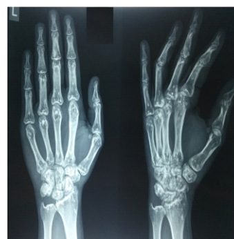
Figure 4: 1 year follow-up X-ray.

There has been no correlation of osteopoikilosis and enchondroma in the literature available to date. Heterozygous mutations associated with isocitrate dehydrogenase 1 and 2 genes have been detected in patients with solitary enchondroma [2]. In osteopoikilosis, both inherited and sporadic forms have been reported. An autosomal dominant pattern that becomes more prominent in each succeeding generation has also been described. It has been associated with a mutation in LEM domain-containing protein 3 gene [3]. One case has been reported of chondrosarcoma in a patient with