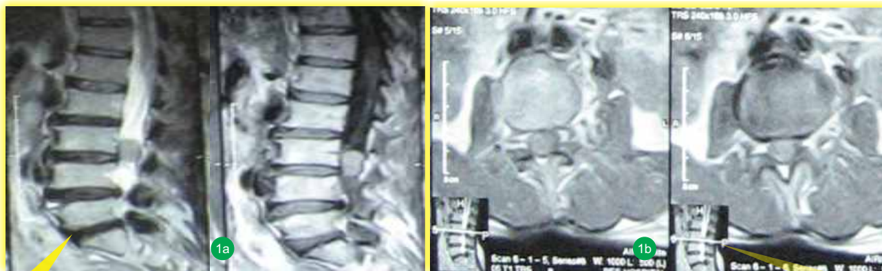
Figure 1 a&b: The MRI of Lumbosacral spine showed a mass 2.1x1.03cm sized space occupying lesion isointense to cord, extra medullary intradural lesion at the level of L3 vertebral body

schwannoma was considered in the differential diagnosis. She was posted for laminectomy at L3-4 level for tumor resection. Intraoperatively the tumor -a red encapsulated and firm mass found attached to a nerve root at L3 level. It was soft, grayish purple in colour and moderately vascular. Cut section showed grey brown with grey white area. The postoperative course was uneventful with complete disappearance of pain and the neurological examination was normal.